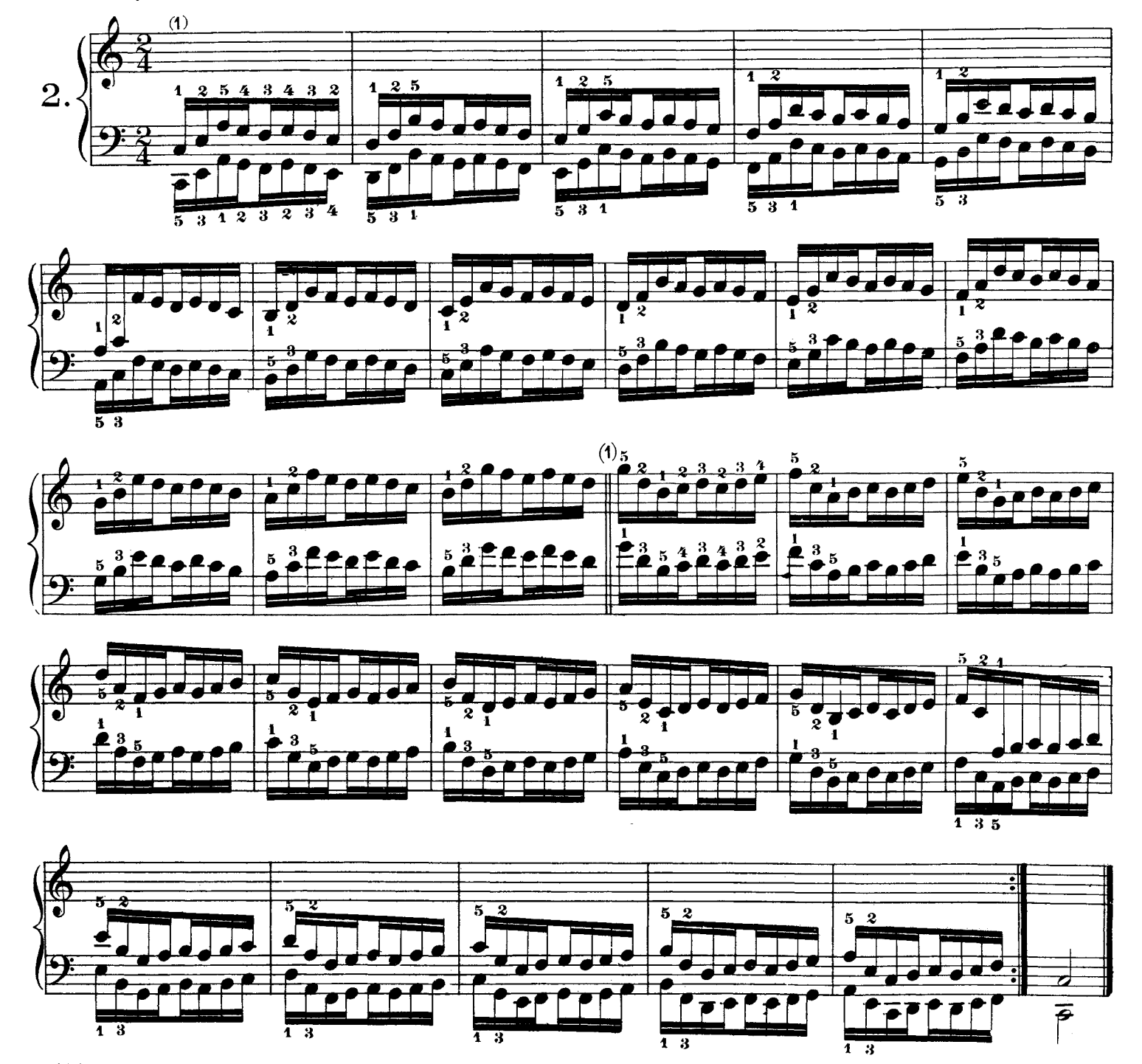
(1) The fourth and fifth fingers being naturally weak, it should be observed that this exercise, and those following it up to N? 31, are intended to render them as strong and agile as the second and third.